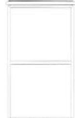
CCA06A-HT00DA Hutch 22W 9.75D 26.25H