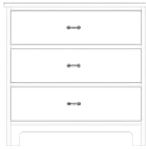
CCA06A-CH03DA 3 Drawer Chest 31.5W 17D 30H