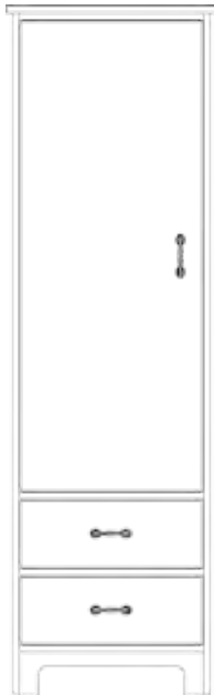
CCA06A-WR12DA 1 Dr / 2 Dwr Wardrobe 23W 24D 72H