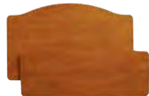
HF1100 Head/Footboard (set) 36W 24H .75D - Headboard 36W 16H .75D - Footboard

OPTIONAL PULLOUT SWIVEL 55-D001-01 23W 16D 2.5H