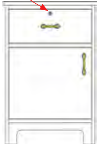
CCA06A-BS11DA Dr/1 Dwr Bedside 22.5W 17D 30H