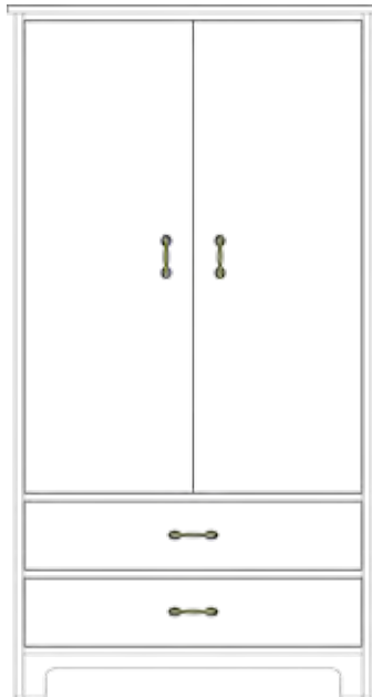
CCA06A-WR22DA 2 Dr / 2 Dwr Wardrobe 34W 24D 72H