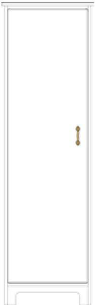
CCA06A-WR10DA Single Wardrobe 23W 24D 72H