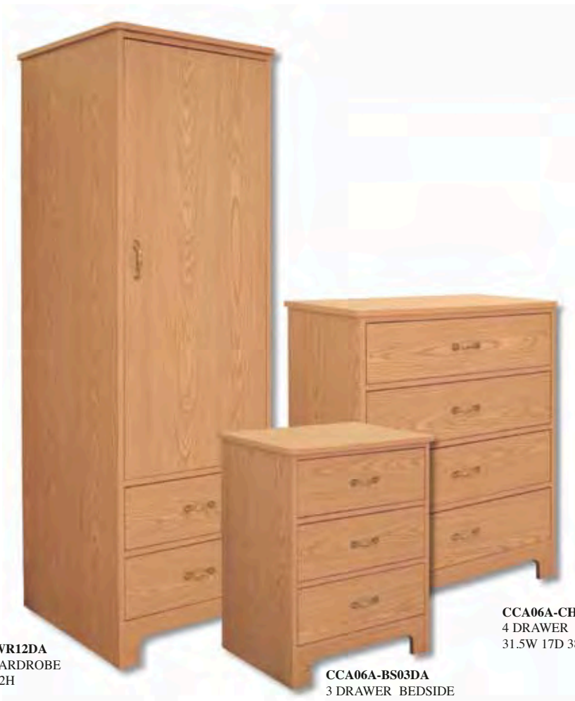
CCA06A-WR12DA SINGLE WARDROBE 23W 24D 72H

The Hearthside Collection is an all laminate group that can be manufactured in virtually any color.