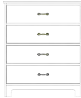
CCA06A-CH04DA 4 Drawer Chest 31.5W 17D 38H